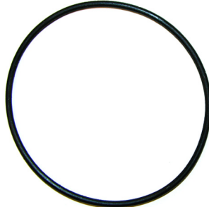
510-019 Reg. Exhaust (1 ea.)