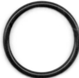
510-017 Bent Tube Adapter (1 ea.) Dial of Breath Packing Nut (1 ea.)