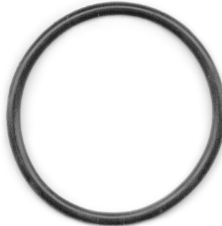
510-029 Comm Port (1 ea.)