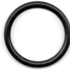
510-015 Bonnet Nut for Steady Flow (1 ea.) Reg. Main Tube (1 ea.)