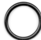
510-483 One Way Valve Mounting O-Ring (1 ea.) Note: This O-Ring is already in the one way valve kit. 525-330